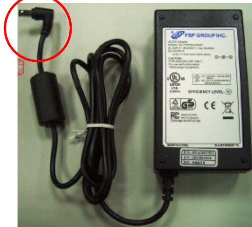
Before – Unlockable Adapter