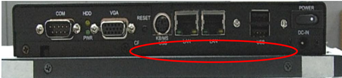
After – With Air Holes